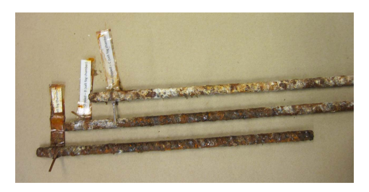
Figure 3 Traditional Hot Dipped galvanizing after 10,700 hours in salt fog exposure

The salt fog exposure revealed large differences between the two specimen types. The hot dipped galvanized bars exhibit almost complete Zinc consumption on all three specimens. (Figure 3.) The ArmorGalv<sup>®</sup> process showed limited visual signs of corrosion. (Figure 4.) There are several rust colored stains that are most likely the result of surface contamination.