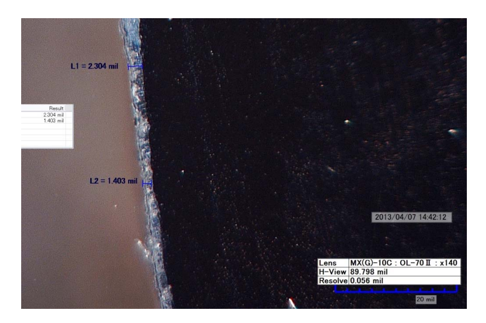
Figure 5 Unexposed specimen of ArmorGalv ^{\circledR}

In addition to the visual observations, a specimen that was exposed to the salt fog environment was cross sectioned and mounted in epoxy and polished to a 1 micron finish for metallographic examination. This exposed specimen of the ArmorGalv® process was compared to an unexposed specimen prepared in like manner. From this comparison, consumption of the coating was not identifiable, primarily due to variations in the measured coating thickness. (Figures 5 and 6.) Although measurements indicated a slight difference in coating thickness of the two specimens, the thicknesses were similar and in fact a thinner coating layer was measured on the unexposed specimen. Since the coating thicknesses measured were similar, there was no measureable coating loss.