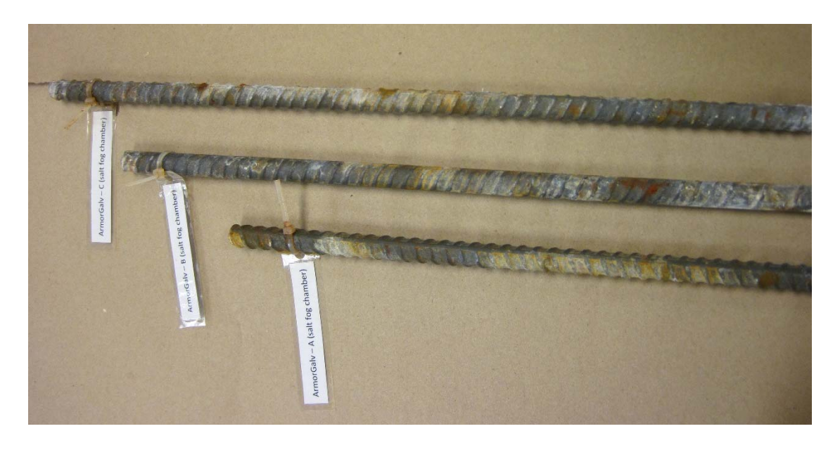
Figure 4 Armorgalv® process after 10,700 hours in salt fog exposure