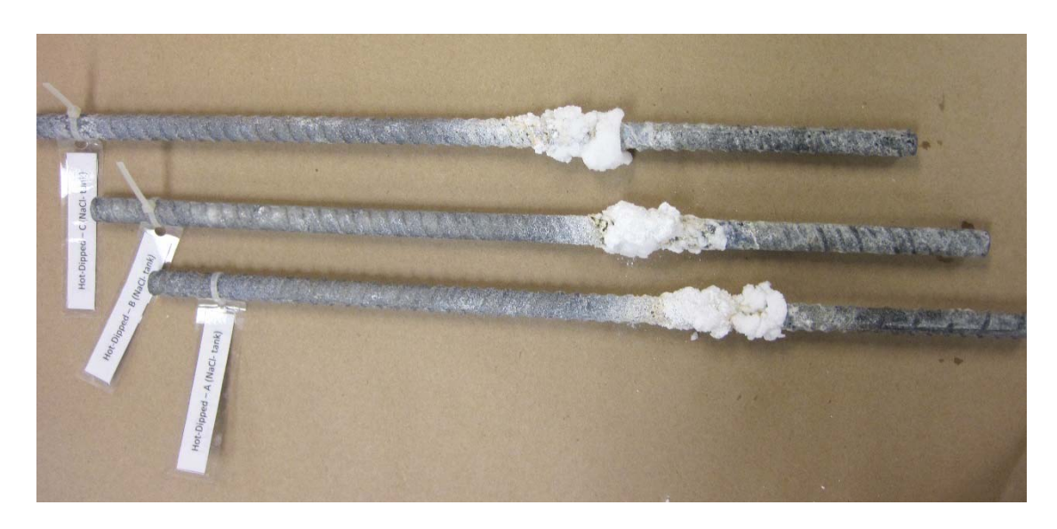
Figure 1 Traditional Hot Dipped galvanizing after 10,700 hours partial immersion

the zinc served as a sacrificial coating. The ArmorGalv ^{\textcircled{R}} process has visual signs of steel corrosion below the water line. (Figure 2.)