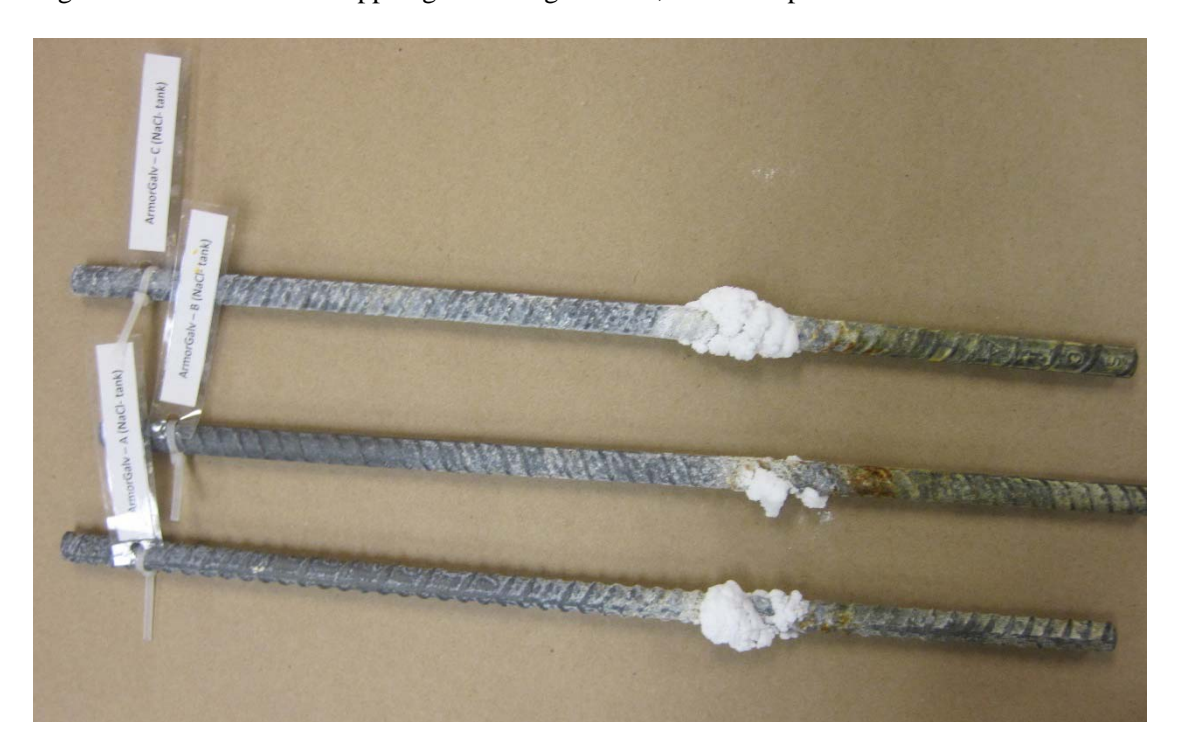
Figure 2 \, Armorgalv ^{\textcircled{\tiny{\$}}} process after 10,700 hours of partial immersion